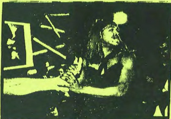
HOT ACTION IN THE SHRIMP ROOM: VAGINAL CREME DAVIS SUCKS THE FEET OF ANOTHER SATISFIED CUSTOMER AT SIN-A-MATIC

How was this allowed to spread so far before it was taken seriously?